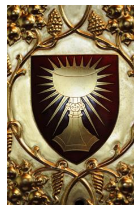
(Tabernacle door in St Peter's Church)

'Many' does not mean that Jesus only shed his blood for some select group of people, or just church people, or religious people. But for many, many people, as many as are willing to receive his sacrifice. That even means the people in your neighbourhood. In fact, every single one of your neighbours, even the mean ones, even the crazy ones, even the ones who don't like you, the ones who argue about the garden fence. These are all people for whom Jesus died. He wants them to be part of his family. As Christians, our challenge is to constantly look at people through this lens.