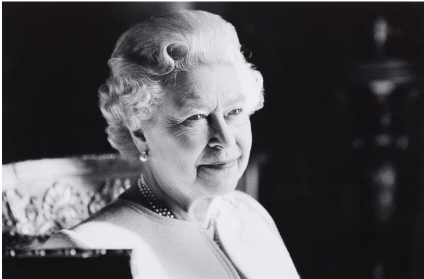
Queen Elizabeth II 1926 - 2022

Twenty-Fourth Sunday in Ordinary Time - Year C