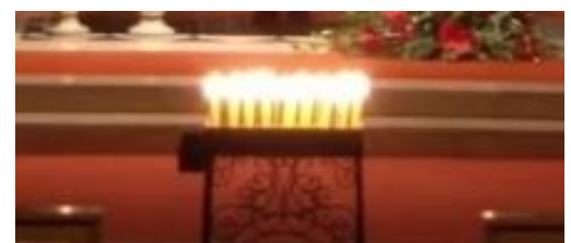
Candles for the Holy Souls in St Peter's church last year

Faith in the resurrection can perhaps also help us to prepare ourselves and our loved ones for the time when we need to say goodbye, in other words for our own death or for that of someone important to us. Death can come upon us in all sorts of different ways, sometimes very suddenly. There are times, though, when we do get chance to prepare ourselves – when we are told that we or someone we love only has a matter of time left to live. In these circumstances, there are things we can do to help prepare ourselves for dying. The church in our country has available a website to help us do just that. It is called "The Art of Dying Well" and it is a modernised version of a Medieval Manuscript, Ars Moriendi - https://www.artofdyingwell.org Why not spend a little time this November looking at this site?