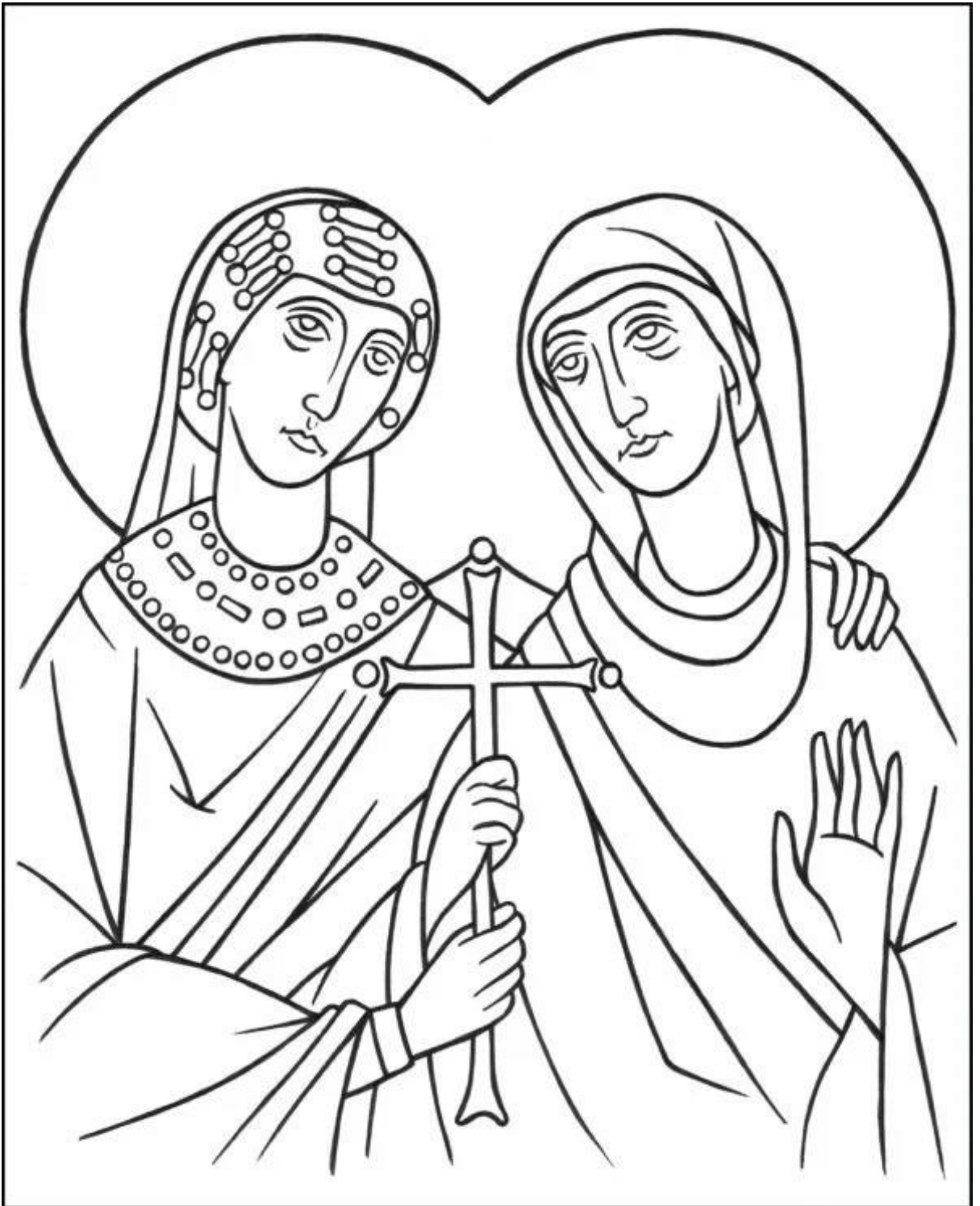
Saint Perpetua & Felicity