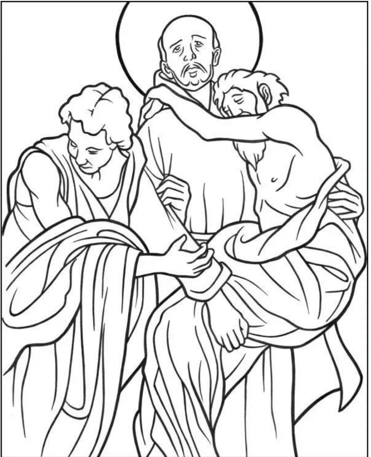
Saint John of God