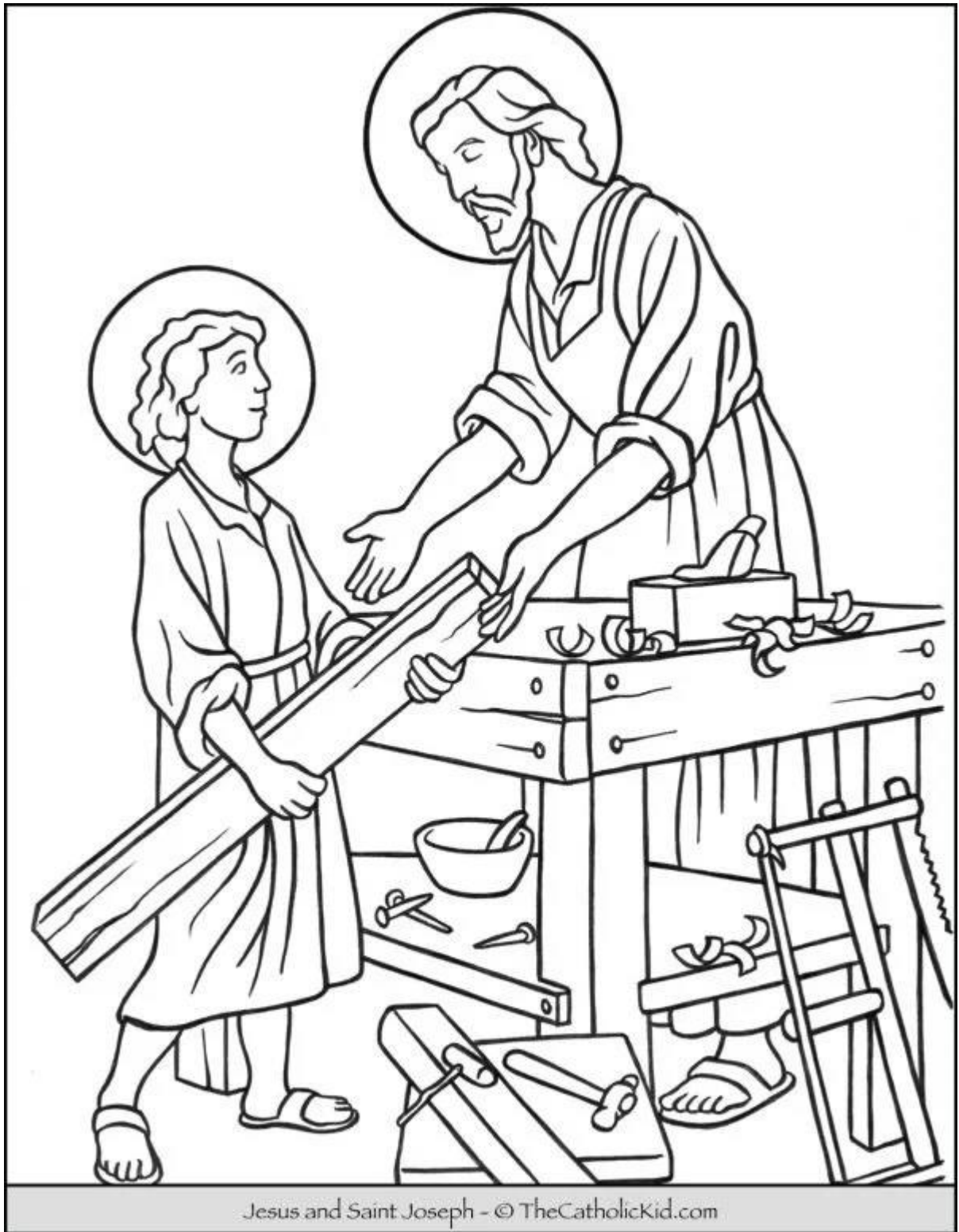
Jesus and Saint Joseph - © TheCatholicKid.com