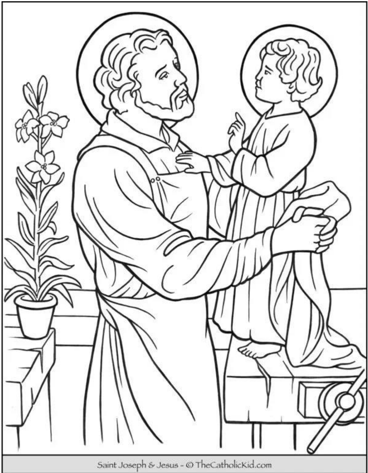
Saint Joseph & Jesus