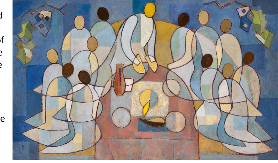
We Are All One in Jesus Christ (2009) by Soichi Watanabe (1949 - )

http://gregorian-chant-hymns.com/hymns-2/lauda-sion.html