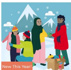
Winter survival kit £30.00

So stuck for Christmas present ideas? It is always lovely to receive a card that lets you know someone has gifted to CAFOD on your behalf as your present from them. CAFOD is the Catholic Fund for Overseas Development. It funds projects including training that helps communities become self-sufficient as they develop.