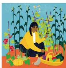
Vegetable garden £5.00

We will be doing collections after the Nativity and Advent Liturgy in aid of CAFOD. If you would like to donate then please bring cash on the day. Thank you.