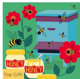
Happy queen bee £4.00