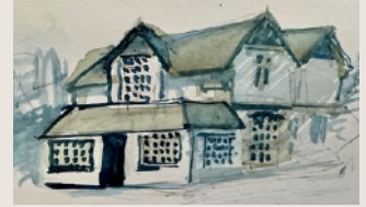
11. Jesus is nailed to the Cross Jolly Farmer pub, Andover Road.