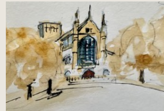
9. Jesus falls for the third time Gravestone, Cathedral Grounds.