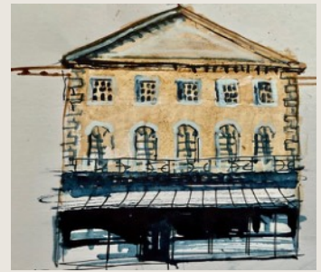
12. Jesus dies on the Cross The Old Gaolhouse, Jewry Street: