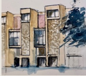
1. Jesus is condemned to death. Winchester Law Courts Romsey Rd