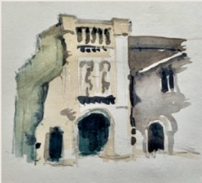
2. Jesus takes up his Cross Westgate, Romsey Road