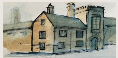
7. Jesus falls for the second time St John's Almshouse, Broadway