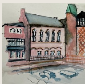
6. Veronica wipes the face of Jesus Nunnaminster, Abbey Passage