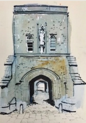
4. Jesus meets his mother Winchester college, College street