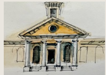
10. Jesus is stripped of his garments The Arc, Jewry St.