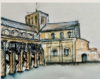
5. Simon of Cyrene helps Jesus carry the Cross The leaning Cathedral southern walls seen from the path