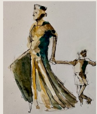
8. Jesus meets the women of Jerusalem. The Statue of Licoricia, Jewry St